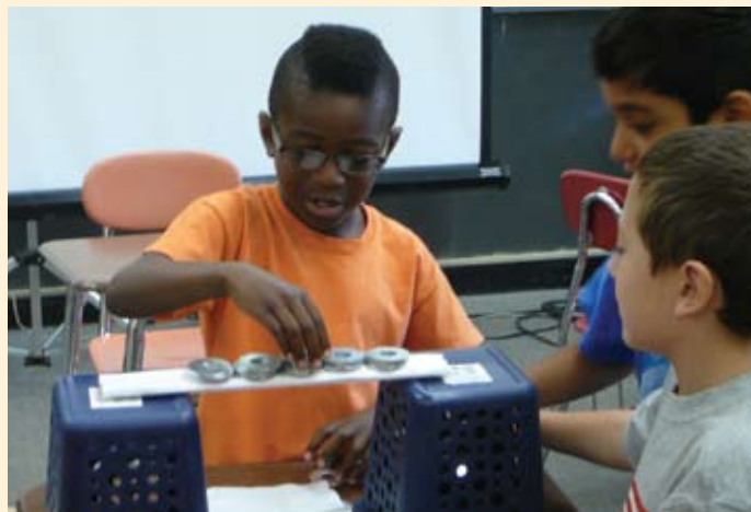
Piscataway students experience hands-on research opportunities.