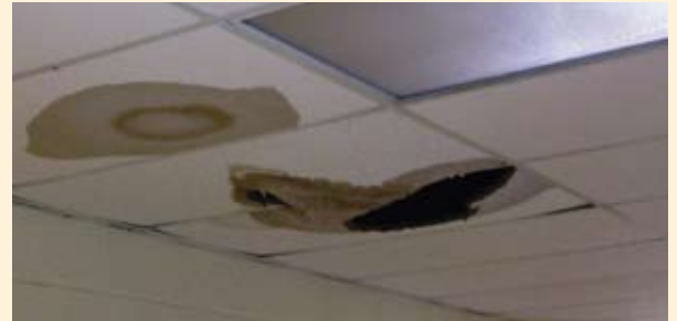
Roof repairs and installation of solar panels will begin this summer as part of an abbreviated renovation plan that spreads necessary repairs over a period of eight years.

Solar panels will be installed on the renovated roofs, but the energy savings will not match the rate of return in the initial referendum. The new project will be funded by a five year lease/purchase agreement. 🍷