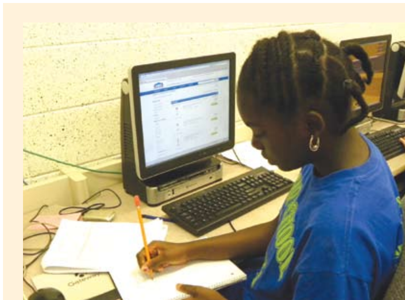
The 2012-13 district budget includes investments in district-wide technology initiatives that support student learning.

A new project that uses iPads for one-to-one learning at the middle school level will be implemented through a lease/purchase agreement from the Office of Community Education. 🍌